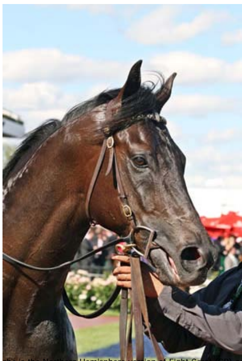
she is the Northern Hemisphere version of Eight Carat (GB) as the dam of an amazing five Group One winners in Banks Hill, Intercontinental, Heat Haze, Cacique and Champs Elysees, while her Group Two winning son Dansilli is one of the best stallions in Europe.