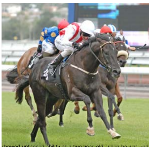
showed untapped ability as a two year-old, when he was unde

Hunter Valley based Byerley Stud are pleased to announce a new addition to the farm for 2009 in the shape of former boom two year-old and smart stakes-winner Sharkbite, a son of 2009 champion sire Redoute's Choice from arguably the best female family in the world.